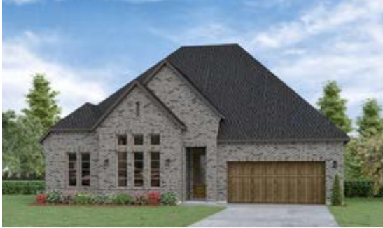
HILL COUNTRY 4 BED | 3 BATH | ONE STORY 2,723 SQ FT