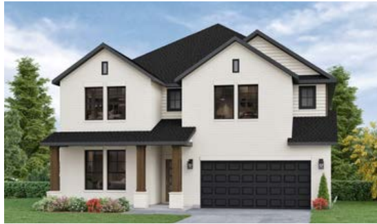
ALPINE 5 BED | 4 BATH | 2 STORY 3,308 SQ FT