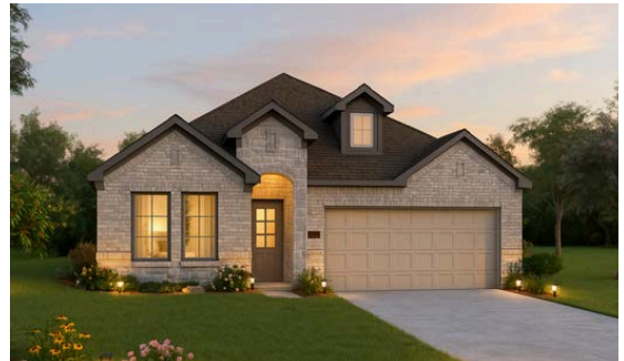
BASSWOOD II 3 BED | 2 BATH | ONE STORY 1,824 SQ FT