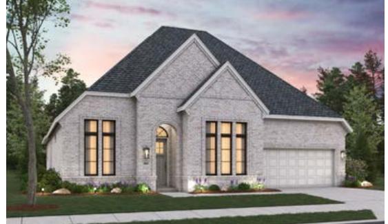
ALAMO 3 BED | 2 BATH | 1 STORY 2,453-2,800 SQ FT