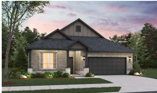
ROWAN 3-4 BED | 2-3 BATH | ONE STORY 2,187SQ FT