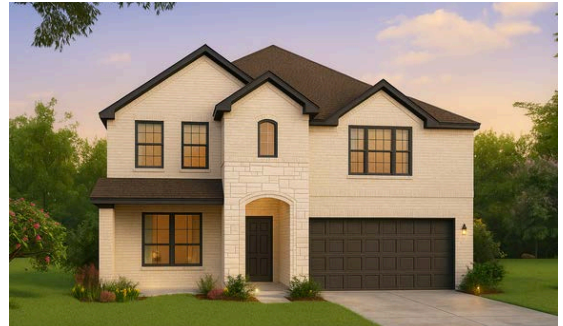
CYPRESS II 5 BED | 2-4 BATH | 1 HALF BATH | 2 STORY 2,973 SQ FT